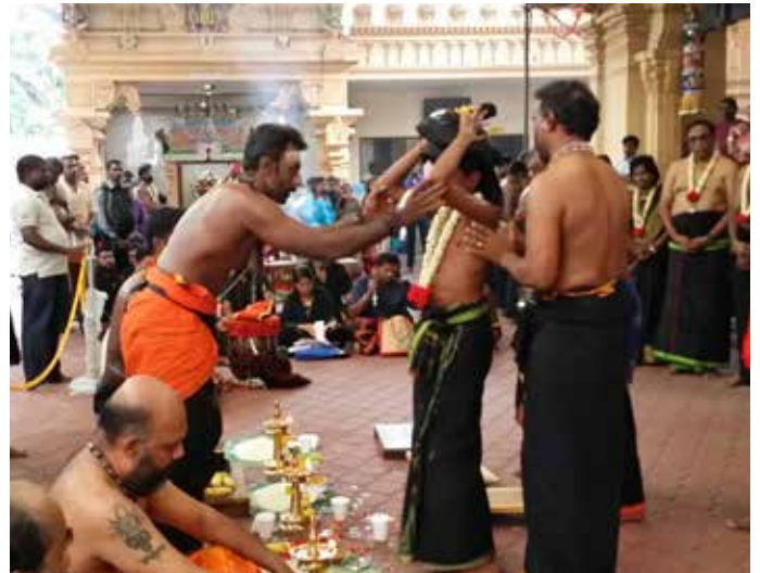
Devotees carrying the Irumudi as part of Makara Vilakku prayers