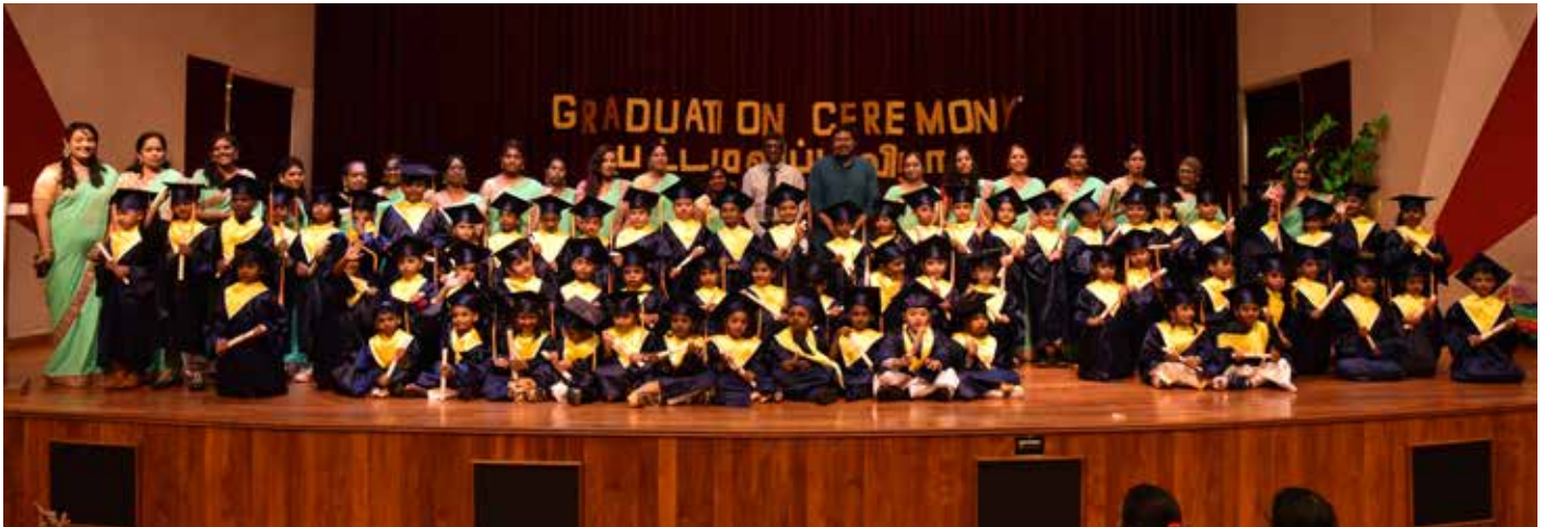
Graduating cohort of 2016

The theme for the graduation concert this year was 'What a Wonderful World'. The children brought home the message of making the world a better place, where people love and care for one another, and for countries to be peaceful and harmonious to live in.