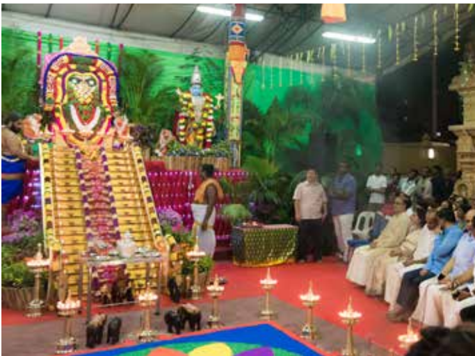
Prayers for Sri Ayyappan at Sri Vairavimada Kaliyamman Temple on 14 January 2017