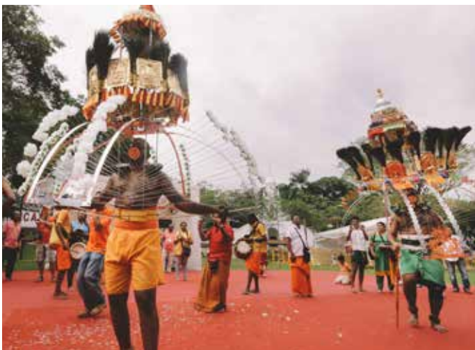
Kavadi bearers dancing at the “live” music point at Bras Basah Green