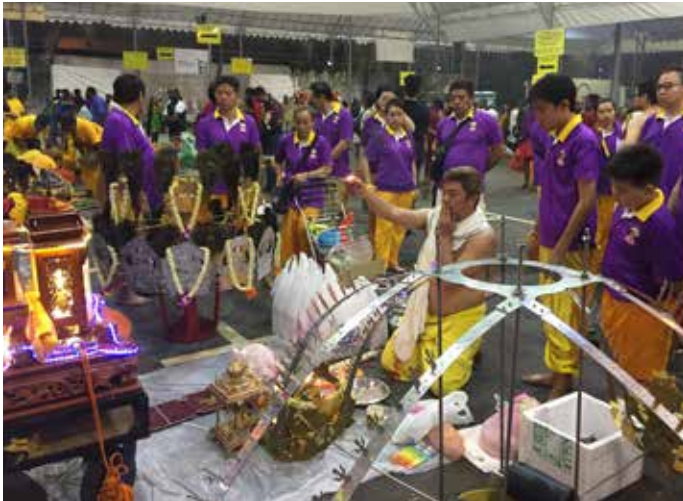
A Festival for one and all – a non-Hindu devotee offering prayers before mounting his kavadi