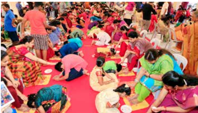
Mothers blessing their children at the completion of 'Maatru Pooja' where the children perform a prayer for them

The highlight was reserved for the finale – the official launch of the PB books and CDs, the revealing of the PB logo and the introduction of the PB Teens’ book on Hinduism FAQs to great fanfare. Although the children were more excited about the cake cutting that followed, the teachers’ highlight seemed to be “seeing the children excited and enjoying themselves throughout the entire day of celebrations”.