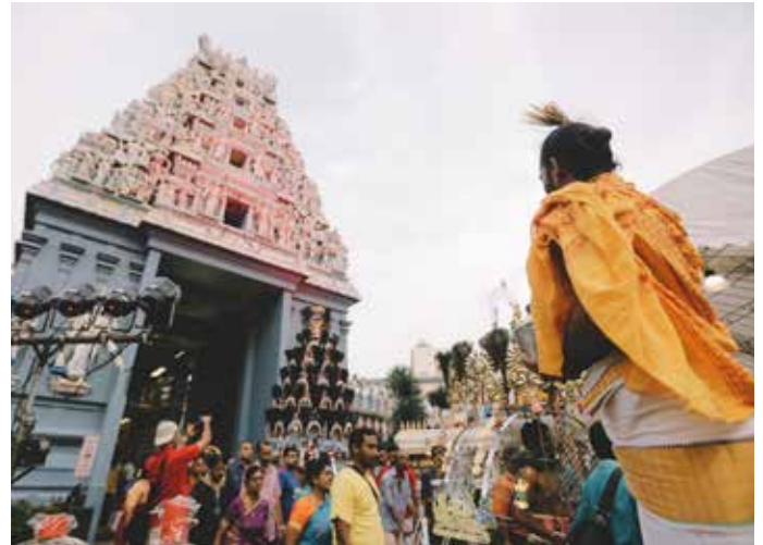
A priest sprinkling holy water on devotees and kavadi bearers as they embark on their journey of faith