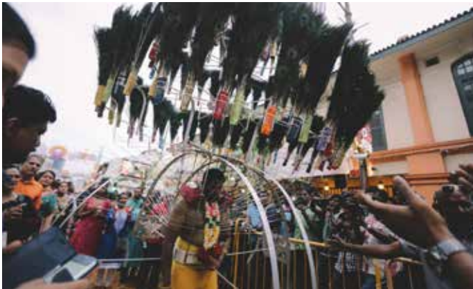
Crowds along the procession route cheering for a kavadi bearer