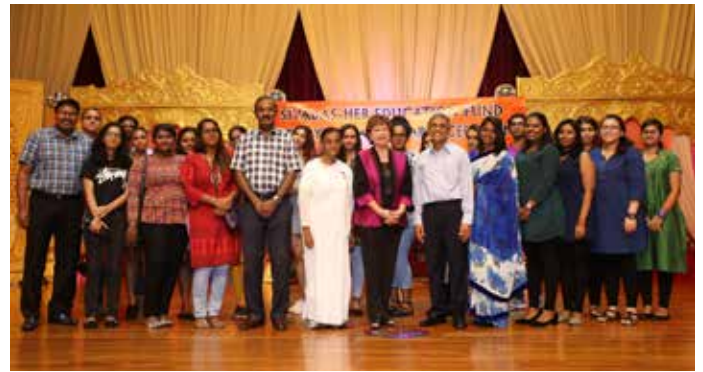
Some of the 236 Sivadas Bursary Awards recipients along with the Trustees managing the Fund on 12 November 2016. Around $540,000 was disbursed to students for furthering their tertiary education in 2016.