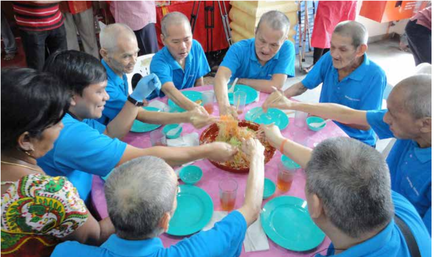
Seniors from Banyan Home tossing 'yusheng' or prosperity salad during the Chinese New Year Reunion Lunch at Sri Mariamman Temple as part of the Temple's initiative to promote community bonding and providing support for the less fortunate.