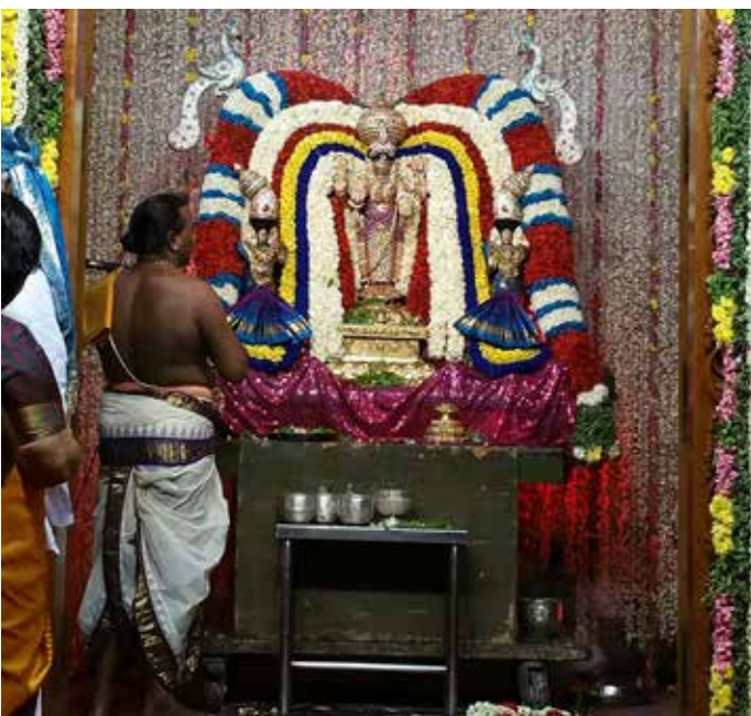
Vaikunda Ekadasi prayers (opening of the Swargavasa) were held at Sri Srinivasa Perumal Temple on 8 January 2017.