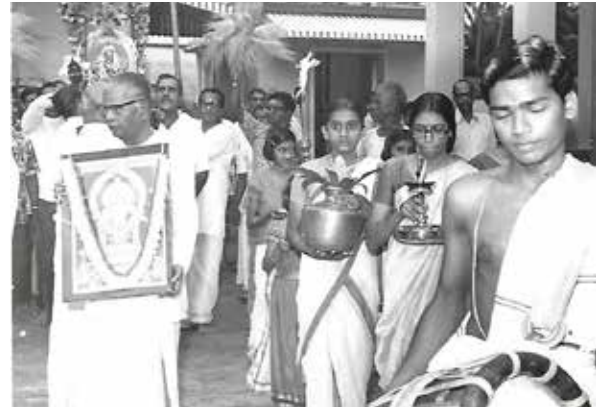
Makara Vilakku celebrations in 1973