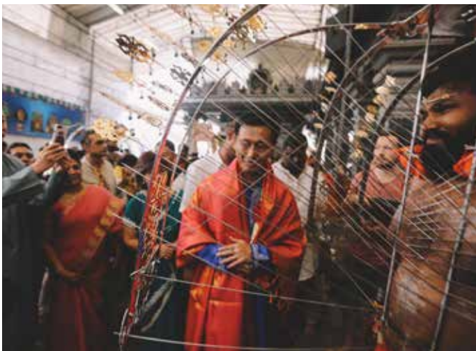
Guest of Honour, Education Minister (Higher Education and Skills) Ong Ye Kung (in red shawl), interacting with kavadi bearers in Sri Srinivasa Perumal Temple