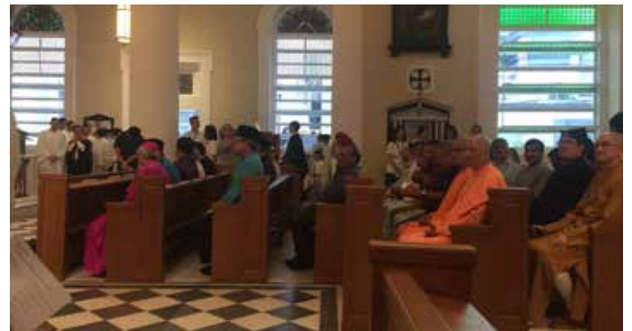
Members of the various interfaith groups at the Archdiocesan Interreligious Christmas celebration held on 29 December 2016 at Cathedral of the Good Shepherd