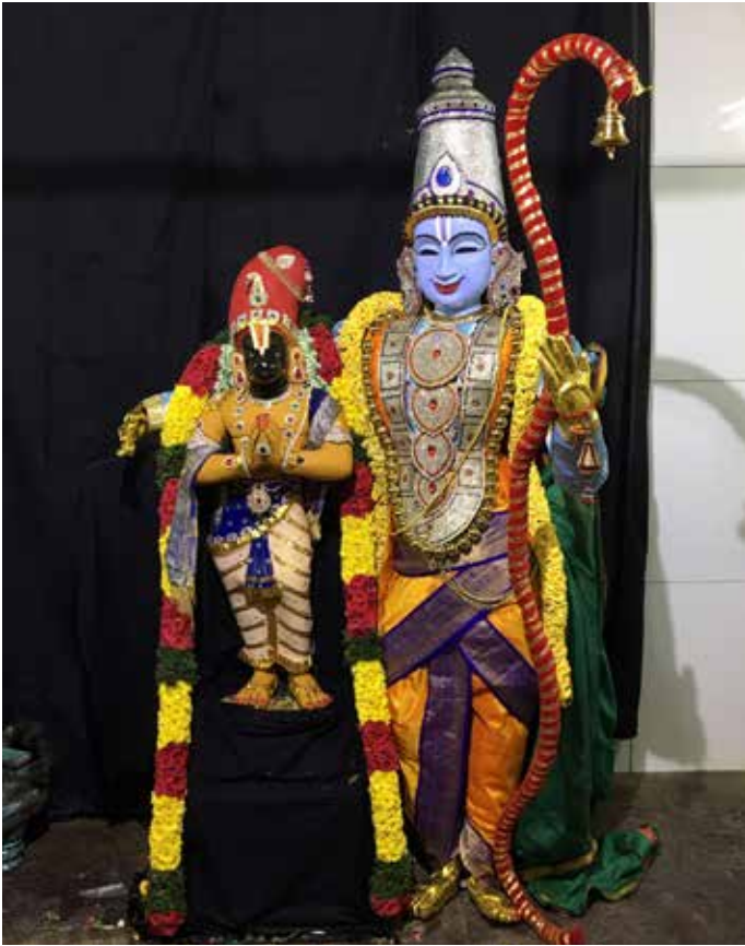
Sri Hanuman Jayanthi alankaram at Sri Srinivasa Perumal Temple on 29 December 2016