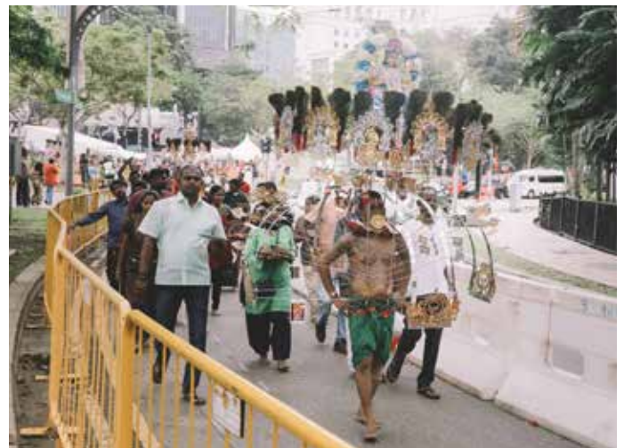
A kavadi bearer along Penang Road – most of the AM kavadi bearers had a smooth walk to Sri Thendayuthapani Temple