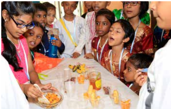
Children learning to make Panchamritam