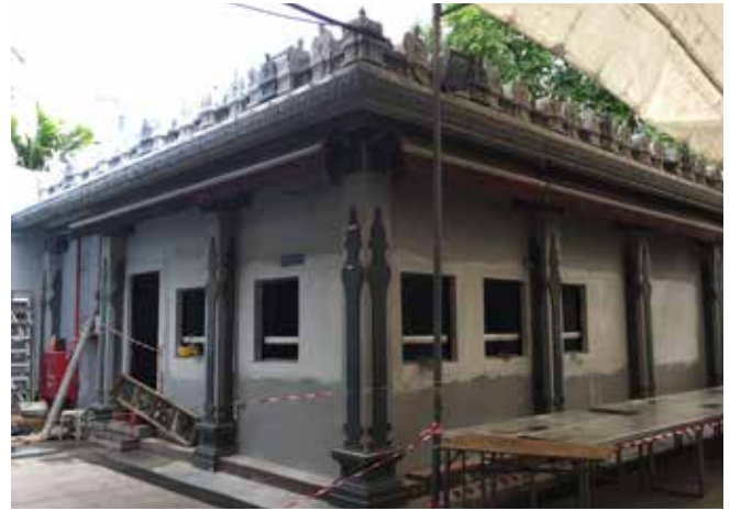
Works on-going for the Temple office to make it more user-friendly

The traditions and Pooja procedures at Sri Srinivasa Perumal Temple are steeped in Vaikhaanasa Agama principles and it is every intention of the Temple's Management to improve on the way poojas and ubayams are done with the help of top Vaishnava scholars.