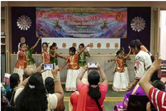
Children performing at Deepa Maalai