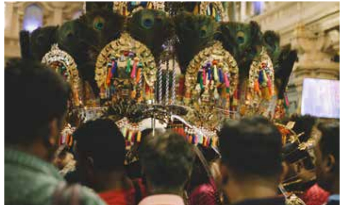
A kavadi bearer finally reaches his destination – Sri Thendayuthapani Temple