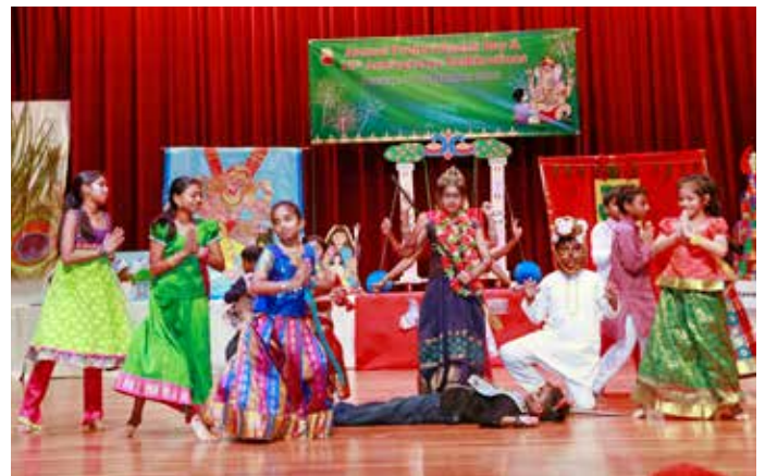
A performance by children during the finale segment