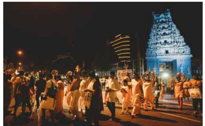
One of the first few batches of devotees carrying paalkudam leaving Sri Srinivasa Perumal Temple for Sri Thendayuthapani Temple