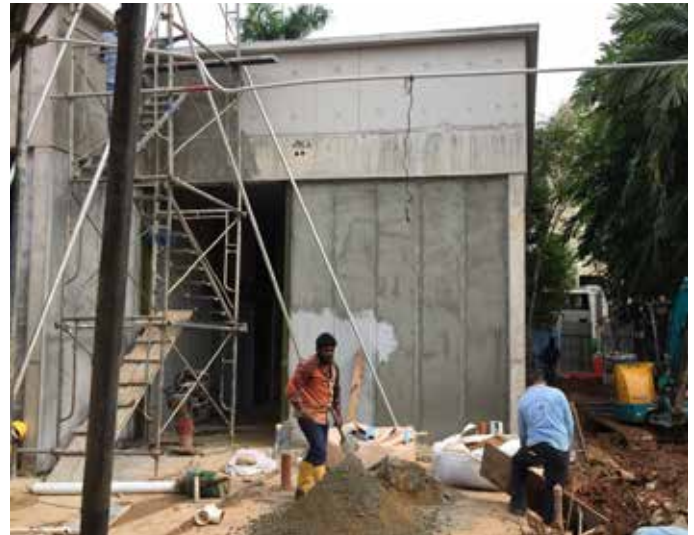
The new Temple kitchen under construction

Hindu News looks forward to a much refreshed Sri Srinivasa Perumal Temple and will bring you regular updates on the Temple's redevelopment works progress in our subsequent issues in 2017.