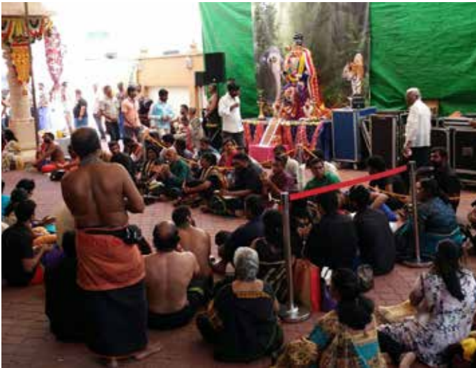
Devotees singing bhajans as part of Makara Vilakku celebrations at the Temple