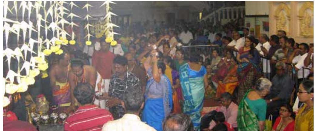
Devotees' paalkudam during the Sri Maha Kala Bhairavar Ashtami prayers held at Sri Sivan Temple on 21 November 2016