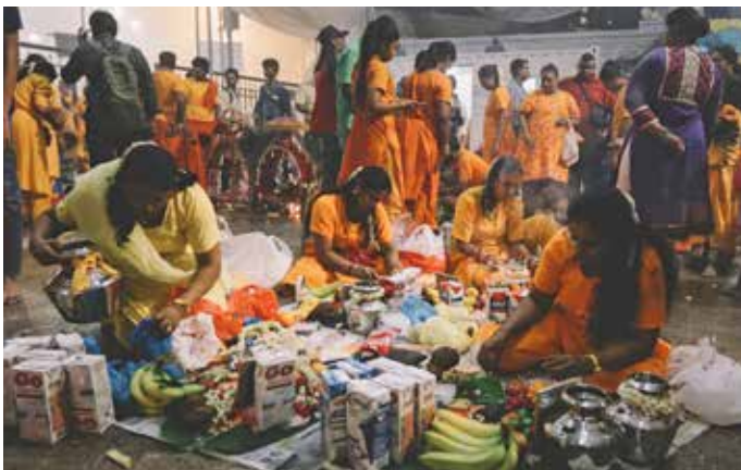
Devotees preparing their paalkudams in the early hours on Thaipusam day

T haipusam is an annual Hindu festival celebrated in honour of Lord Murugan. Thaipusam was observed on 9 February this year. Around 50,000 participants and observers gathered for the Festival which stretched from Serangoon Road to Tank Road. Hindu News brings you the highlights of the Festival in pictures.