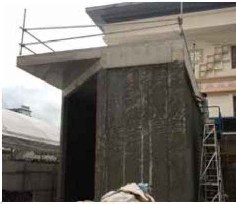
New home for the silver chariot under construction

Though Vastu started out with the construction rules for Hindu temples, it soon branched out to cover residential houses, office buildings, vehicles, sculpture, paintings and even what kind of furniture to buy for the home, office and Temple rooms, how to place the conference table in a meeting room and where the leader of an organisation should sit to conduct meetings.