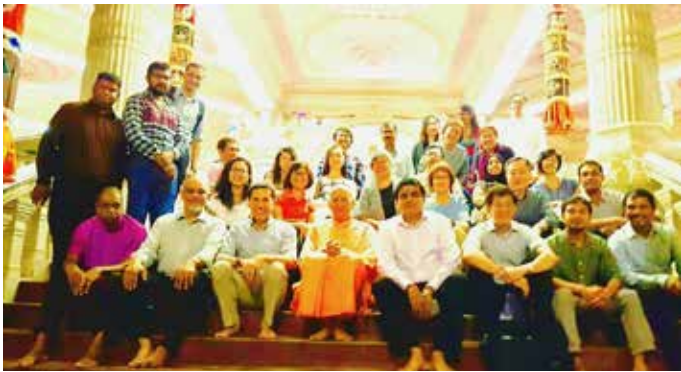
Visit by participants of the 2nd Studies in Inter-Religious Relations on Plural Societies (SRP) Executive Programme held at Sri Sivan Temple in November 2016