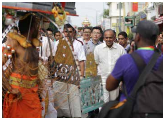
Mr K Shanmugam (Minister for Home Affairs and Minister for Law) meets kavadi bearers and thanneer pandhal volunteers during his walk along the procession route