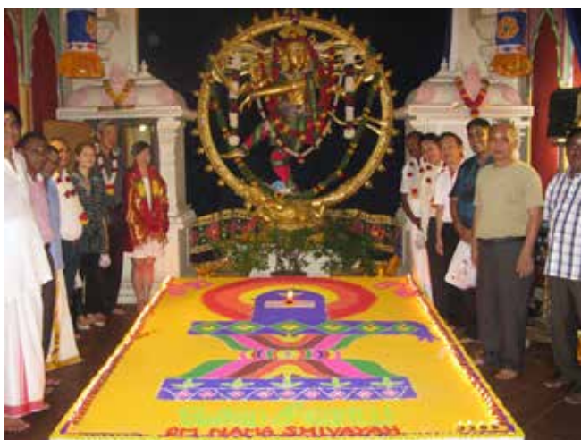
Involving well-wishers from the community – MP for Macpherson, Ms Tin Pei Ling, at Thirukarthigai at Sri Sivan Temple on 12 December 2016