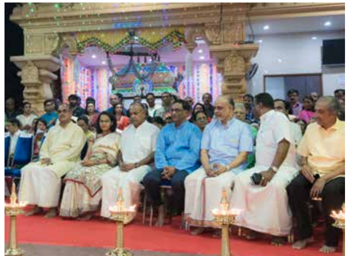
Special guest Mr K Shanmugam, Minister for Law and Home Affairs (seated, third from left) at the event