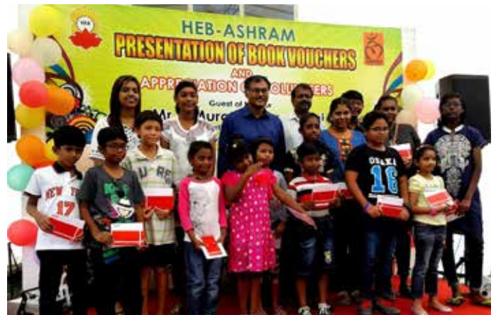
Mr Pillai with some of the children who received the book vouchers

H EB-Ashram Management Committee has placed great emphasis in the rehabilitation and reintegration of the residents so that they are able to lead a normal life after their release. On 27 November 2016, HEB-Ashram Halfway House organised the 'Back to School' event for Ashram's current and ex-residents' children. During this annual event, Ashram gave away book vouchers worth $100/- and a voucher worth $50/- to purchase school shoes to about 40 children. Mr Murali Pillai, Member of Parliament for Bukit Batok, presented the vouchers to the children.