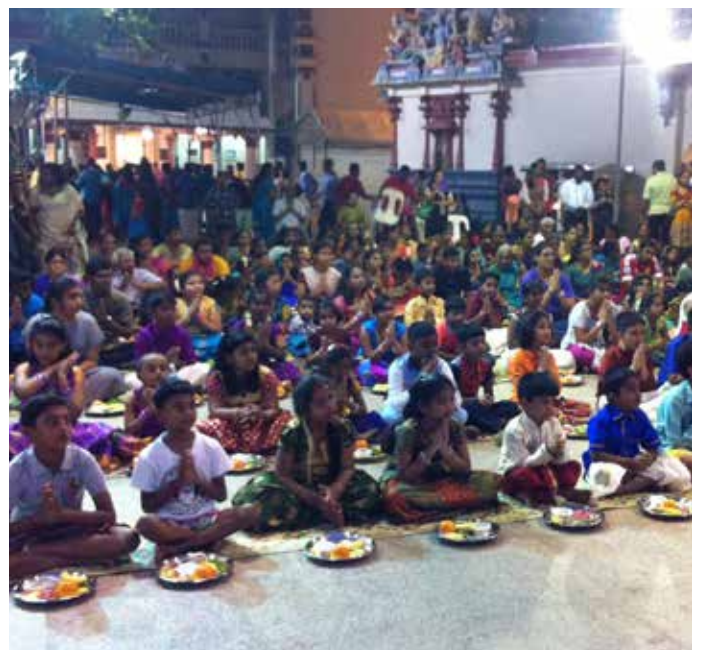
Children performing a prayer to seek the blessings of Sri Saraswathy (Goddess of Knowledge) at Sri Mariamman Temple on 8 January 2017