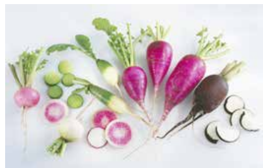
Radish (Raphanus sativus) belongs to the mustard family. It is known as mulangi in Tamil.

Radish is very good for skin because it contains vitamin C, phosphorus, zinc and vitamin B-complex elements. Grated raw radish is a good skin cleanser and can be used as a face pack. Its disinfectant properties can help cure drying up of skin, rashes and cracks. It is good for overall health of the kidneys. The anti-pruritic properties help against itching and is efficacious in insect bites. Its juice reduces pain and swelling of the bitten area. Radish juice mixed with black salt is a disinfectant and fights infections, fever and in respiratory disorders.