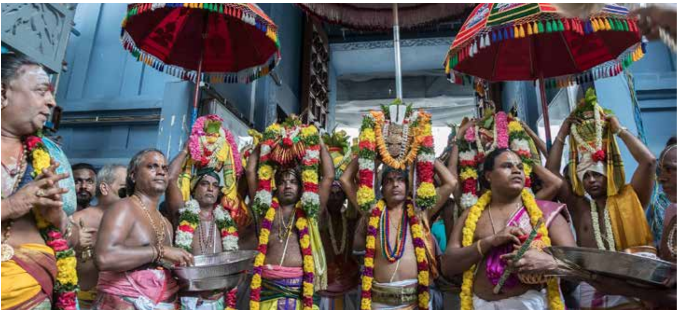
யாக சாலையிலிருந்து பெருமாள் மற்ற பரிவார தெய்வங்கள் புறப்பட்டு பாலாலயத்திற்கு எழுந்தருளினர்.