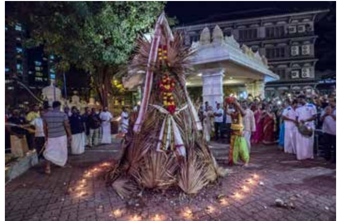
Devotees throng Sri Sivan Temple on the occasion of Karthigai Deepam.