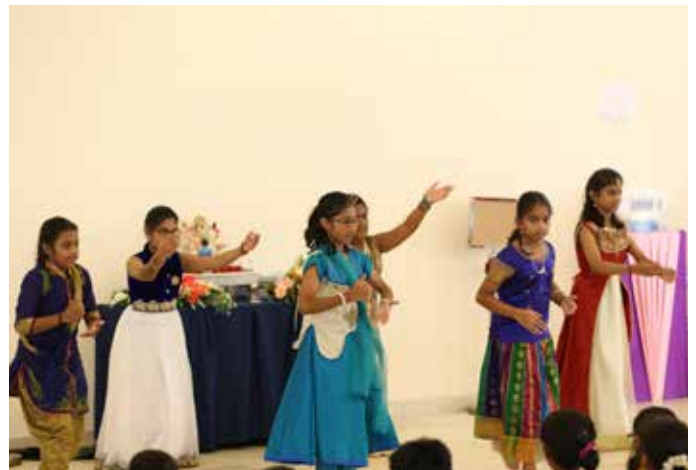
Showcase of dance talent by students from Sri Muneeswaran Temple