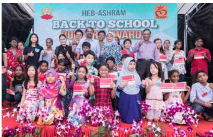
President Halimah Yacob with some of the beneficiaries at the event

'Back-to-School' is an initiative by HEB-Ashram to help school-going children of past and current residents. The event was first introduced in 2015 and reached out to 30 recipients. This year, HEB-Ashram reached out to as many as 45 recipients, including beneficiaries from Sembawang Community Centre. President Halimah Yacob visited HEB-Ashram Halfway House's Back-to-School event and presented gift vouchers to the children on 19 November 2017. During her visit, President Halimah Yacob toured HEB-Ashram's eco-garden. The eco-garden is the pride and joy of the residents of HEB-Ashram who have found gardening to be both rehabilitative and therapeutic. President Halimah said, "Happy to spend the morning at HEB-Ashram Halfway House and to present book vouchers to its residents' school-going children."