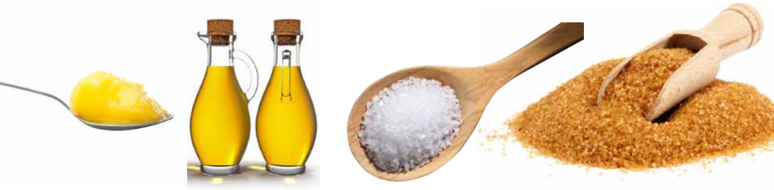
Ghee, oil, salt and sugar levels are consciously being reduced for health benefits.

should also take the responsibility to reduce unhealthy levels of sugars and not demand for the higher level of sweetness as was before.