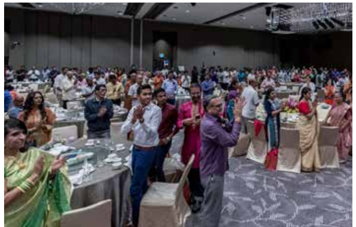
A thunderous standing ovation was given to all volunteers in recognition of their dedicated service.