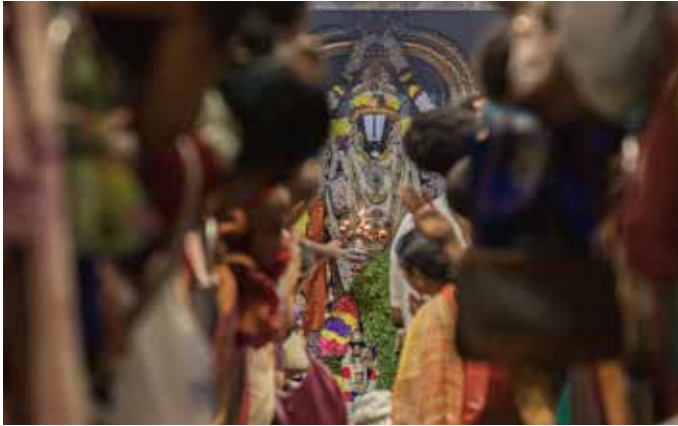
Devotees paying homage to Sri Srinivasa Perumal during the Purattasi Saturday morning prayers.

P urattasi is an auspicious month to offer thanks to Sri Srinivasa Perumal (Lord Venkateswara) for preserving the universe. Crowds numbering between 10,000 and 15,000 devotees were received at Sri Srinivasa Perumal Temple during each Purattasi Saturday. Arrangements were made for devotees to be seated comfortably during the Annathanam. Separate queues were formed for the elderly, those with special needs and families with young children. Each week, the entire operations of the Annathanam were driven by the dedicated volunteer force.