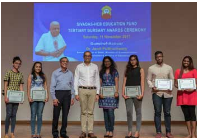
Dr Janil (fourth from right) presented the bursaries to students from various tertiary institutions at the award ceremony held at the PGP Hall.

W hile the Sivadas-HEB Education Fund initially disbursed financial aid to pre-schoolers in 2011, from 2012 it was extended to students in local universities, Institutes of Technical Education and Polytechnics. At the Sivadas-HEB Bursary Awards Ceremony held on 11 November 2017, Dr Janil Puthuchery, Senior Minister of State, Ministry of Communications and Information and Ministry of Education presented 127 bursaries worth about $259,000. As of November 2017, the Fund has helped more than 1300 students and disbursed around $2.5 million.