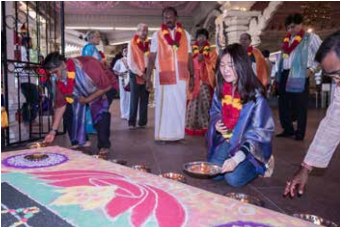
Neighbours and community leaders at Sri Sivan Temple.

K arthigai refers to the Tamil month and ‘deepam’ means light. According to the Saiva Agamas, during the full moon day in the month of Karthigai, Lord Siva is adored as the boundless form of eternal fire. He assumes the form of fire to dispel darkness, ego, jealousy and ignorance in the world to bring forth spiritual enlightenment. Hence, devotees light ghee lamps on Karthigai day to invoke the blessings and guidance of Lord Siva. Religious and community leaders joined Sri Sivan Temple’s Karthigai Deepam celebrations on 2 December 2017.