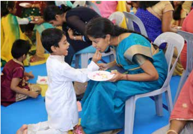
A student feeding sugar candy prasadam to his mother at the conclusion of the Maathru Pooja