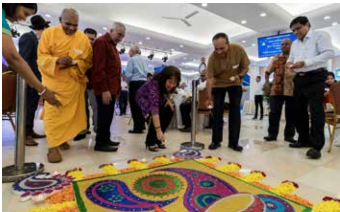
Guests had an opportunity to light and display agal vilakkus (terracotta lamps) at the rangoli.

The inaugural Interfaith Deepavali Tea jointly hosted by Hindu Endowments and Hindu Advisory Boards was held on 16 November 2017. Interfaith and community leaders from all ten religions in Singapore were present on the occasion. They learnt about the significance of Deepavali through an informative exhibition, were treated to musical and dance performances, and had an opportunity to savour Deepavali delicacies.