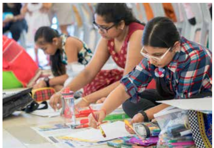
Children expressed their creativity and devotion through art during the competition organised as a feature of the Gita Forum.