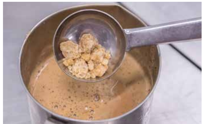
Healthier choice – vellam or jaggery can be used to sweeten tea instead of refined sugar

Secondly, instead of red sugar, they have started using 'karupatti' or 'vellam' (Indian version of gula melaka). Even coffee can be made with 'karupatti' but that will need some time before devotees get used to the taste. Alternatively, one can opt for Sukku coffee, which is healthier. The rice that temples are buying is also of a better quality with a lower Glycemic Index. The secret to lowering sugar levels is consuming lesser quantity of rice.