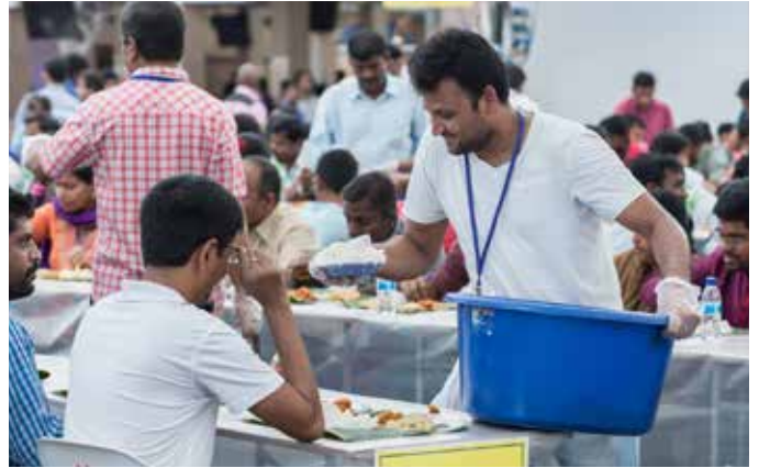
Volunteers worked tirelessly to serve meals to devotees during each of the Purattasi Saturday Annathanams.