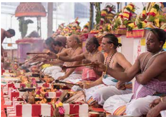
Priests performing homam for the respective deities enshrined in Sri Srinivasa Perumal Temple during the Bhalasthapanam prayers.

A s a precursor for the slated redevelopment works at Sri Srinivasa Perumal Temple, a Sri Sudarsana Laksha Yagam was held from 19 to 29 October 2017. Subsequently, the Moolavars (deities) were relocated to a temporary location (Balaalayam) within the Temple. During the Bhalasthapanam prayers held from 21 to 23 November 2017, the divine powers of the deities were temporarily enshrined in kumbhams (holy vessels). They were energised with various homams (fire sacrifices) and chants, and eventually transferred back to the Moolavars.