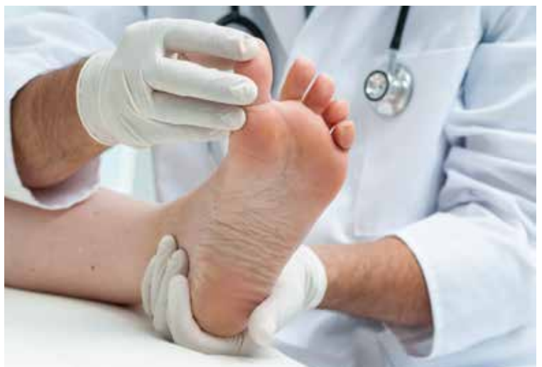
Diabetics have to pay careful attention to their feet.