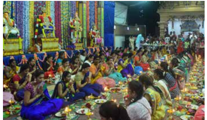
108 devotees performed the special vilakku poojai on 12 November 2017 as a culmination of the two-day event.