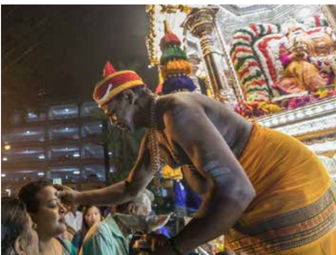
Silver Chariot with diety of Goddess Sri Mariamman visits the heartlands: Devotees who are unable to travel to the Temple on a regular basis feel blessed with the divine visit from the Goddess.

T heemithi or Fire Walking Festival was held at Sri Mariamman Temple on 8 October 2017. A silver chariot with Goddess Sri Mariamman visited the heartlands on 6 and 7 October 2017 and on 9 October, Goddess Drowpathai was brought to the Little India district in conjunction with the festival.