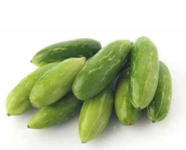
Pavakkai and kovakkai are good vegetable options to keep diabetes in check.