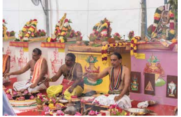
நவம்பர் மாதம் 21, 22, 23 தேதி ஆகிய மூன்று தினங்களும் நடைபெற்ற பெருமாள் பாலாலயம் 4 கால யாக பூஜை.

இந்தியாவிலிருந்து தேர்ச்சிபெற்ற பத்து வைகானஸ பட்டாச்சாரியார்கள் இந்த யாகத்தினை சிறப்பாக நடத்தி வைத்தார்கள். இந்த யாகத்தில் கலந்து கொண்ட பக்தர்களுக்கு 10 தினங்கள்