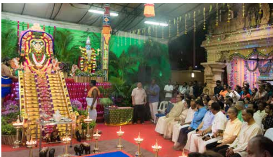
Makara Vilakku is one of the major festivals celebrated at Sri Vairavimada Kaliyamman Temple.

was built before the temple itself. Upon completion of the temple complex, a consecration ceremony was held on 27 March 1986. Sri Vairavimada Kaliyamman Temple holds the honour of introducing Saraswathy Kindergarten – the first Tamil and English pre-school in Singapore. The service proved to be so popular that a full-fledged kindergarten was set up at Kim Keat in 1990. The main festivals celebrated here are Chithira Pournami, Brahmotsavam, Santhanakudam Abishegam, Periyachi Pooja and Makara Villaku.