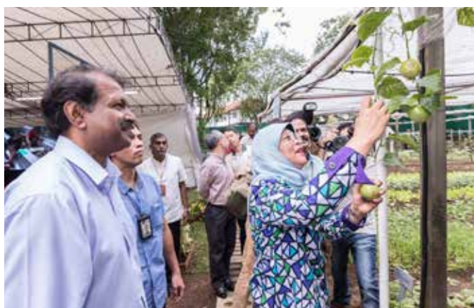
President Halimah harvesting passion fruit after touring the eco-garden set up with the help of volunteers and HEB-Ashram residents.