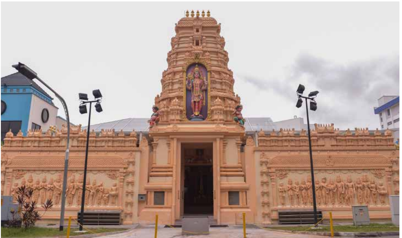
Sri Vairavimada Kaliamman Temple is located within the Toa Payoh heartlands.

Unfortunately, the railway authorities once again acquired land owned by the temple and it had to be relocated for the second time. In 1921, a new piece of land at 21 Somerset Road (just in front of the Telecoms building) was purchased for building the temple. The temple structure at this location was constructed by the Mohammedan and Hindu Endowments Board in 1933. A