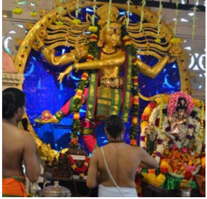
Observance of the Arudra Dharisanam at Sri Sivan Temple

Swamy purappadu (deity procession) following the prayers