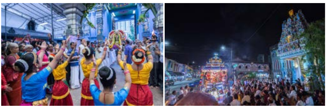
Cultural performances by children for the Lord