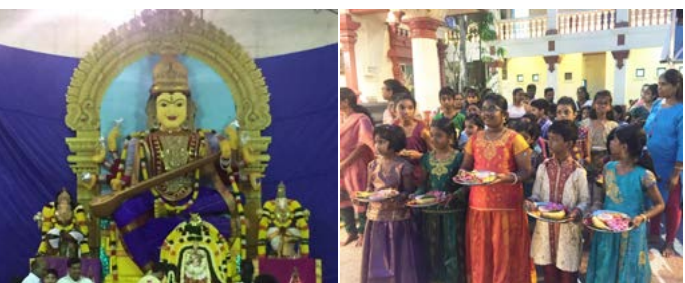
Rajamathangi alankaram at Sri Mariamman Temple