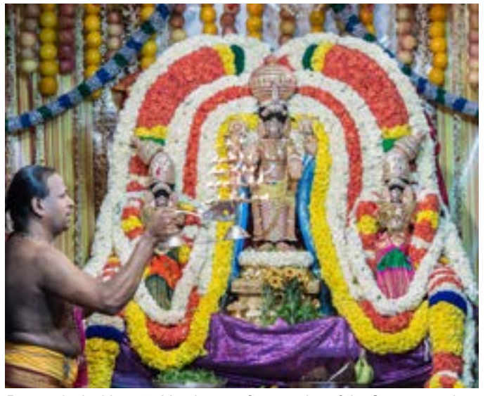
Prayers in the Vasanta Mandapam after opening of the Swargavasal