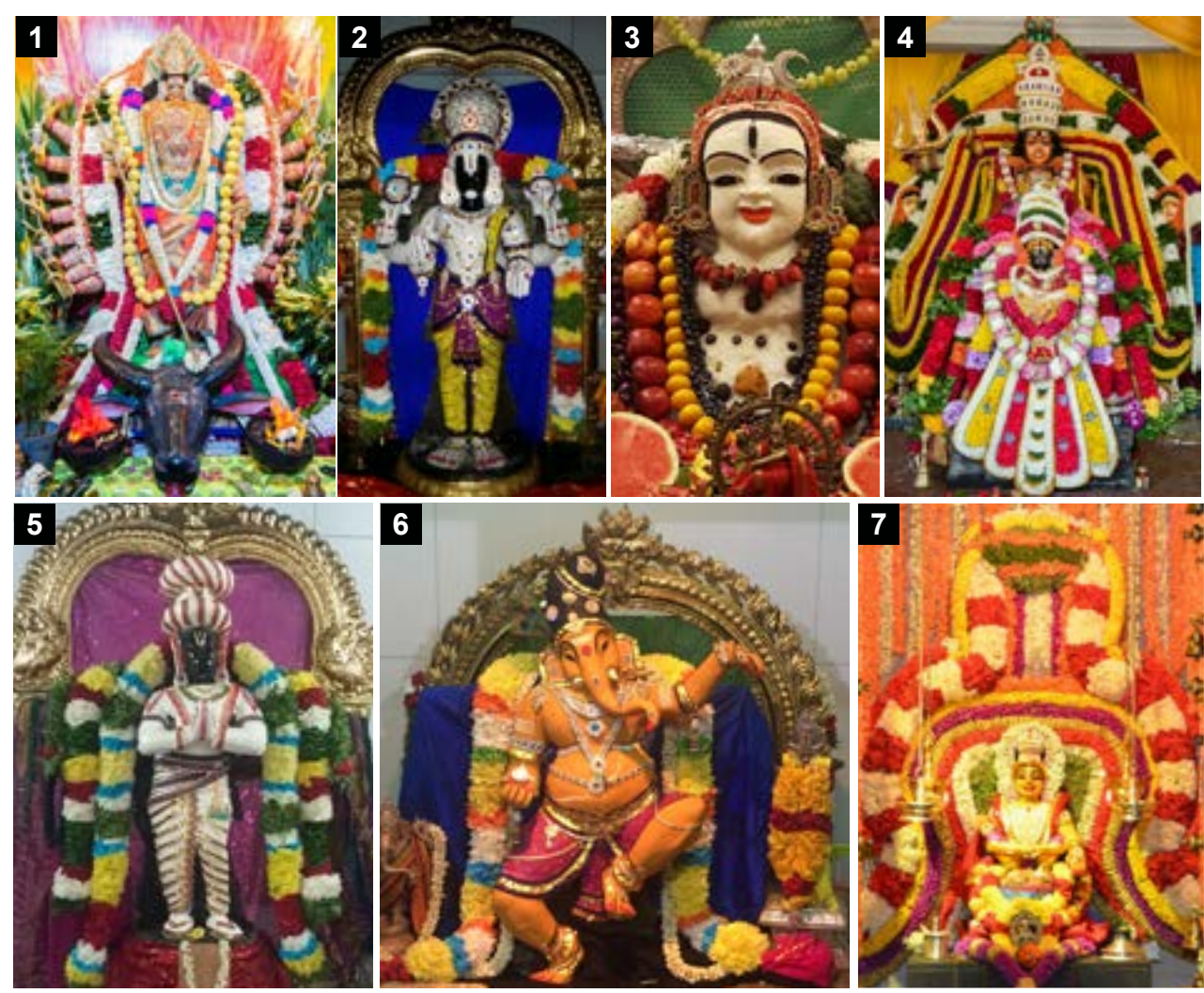
(1) Sathupadi alangaram for Sri Mariamman during Navarathri; (2) Alangaram with rice flour (Maakaapu) for Sri Srinivasa Perumal; (3) Rice and fruits alankaram for Sri Viswanathar on Aippasi Pournami (Annabishegam); (4) Flower alangaram for Sri Periyachi; (5) Vennaikaapu (butter) alangaram for Sri Anjaneyar; (6) Sandal paste alangaram for Sri Vinayagar (Narthana Ganapathy); (7) Flower and sandal paste alangaram for Swamy Ayyappan

Hindu News is pleased to present you with a pictorial layout of some of the alangarams done by our Temple Alangara priests.