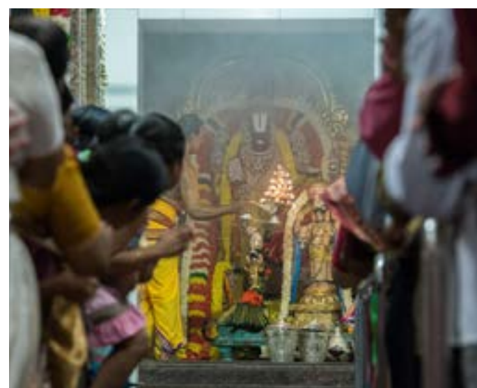
Viswaroopam on the morning of Vaikunda Ekadasi