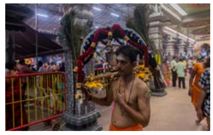
A devotee carrying a simple kavadi

The simplest kavadi consists of a short wooden pole surmounted by a wooden arch. Pictures or statues of Lord Murugan or other deities are fixed onto the arch. The kavadi is decorated with peacock feathers and a small pot of milk is attached to each end of the pole.