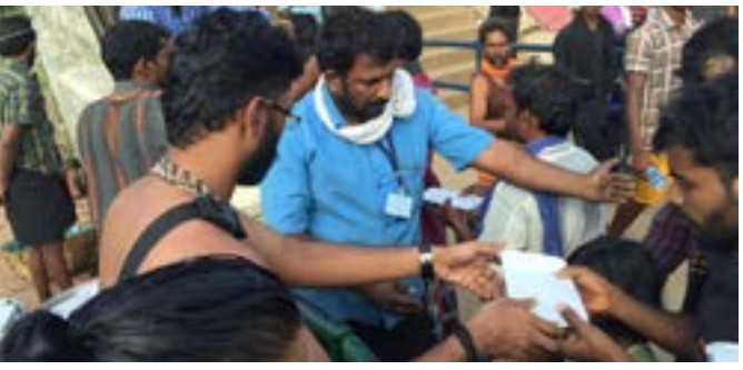
Distributing food packets