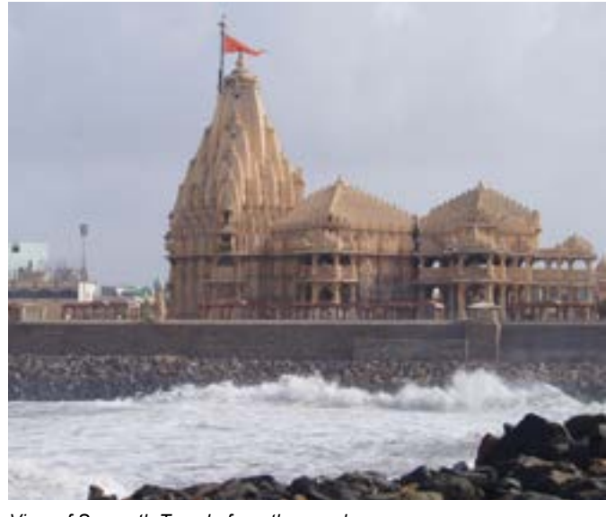
View of Somnath Temple from the seashore